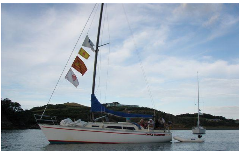
Choice Transport in summer mode

Check out www.farr1020.org.nz for Committee's contact email addresses.