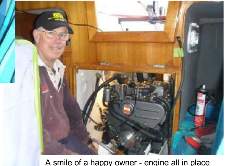
A smile of a happy owner - engine all in place