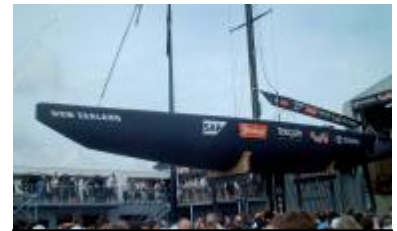
NZL82 showing what's under her skirts.

The Farr 1020 Owners Assn aims to provide a medium for exchange of information amongst owners to enhance their enjoyment of their yachts